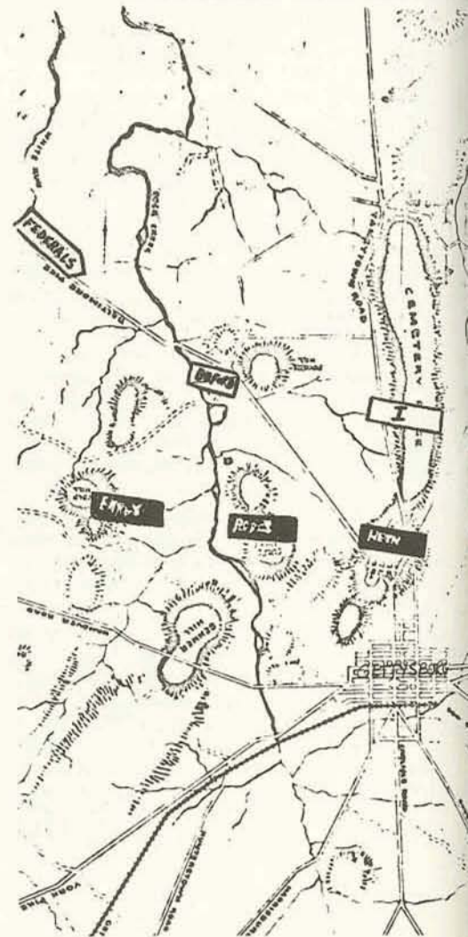
PROPOSED CONFEDERATE POSITIONS

On July 2, the Army of the Potomac was in a well-drawn position with the bulk of its forces on hand. Meade's line was in a horseshoe shape. The left lay along Cemetery Ridge, the center on Cemetery Hill, and the right on Culp's Hill and along Rock Creek. The Confederates assaulted the Federal positions on Culp's Hill and Cemetery Hill in the morning but met with small success. In the afternoon, part of Longstreet's First Corps — which had arrived at Gettysburg throughout the night of July 1, and during the early afternoon of July 2, — attacked a salient position that the III Corps had moved into. They smashed the Union troops back and seemed about to capture Round Top, a hill which would have enabled to enfilade the Union left flank, when a hastily gathered Yankee brigade reached the crown of the hill in advance of the Southerners and flung them back.