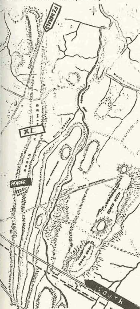
AT GETTYSBURG 5:00 p.m. July 1

Gary Gygax 330 Center Street Lake Geneva, Wisconsin 53147